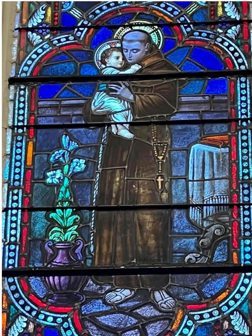
#12 St. Anthony

In 285, at the age of 34, he decided to follow the words of Jesus, who had said: "If you want to be perfect, go, sell what you have and give to the poor, and you will have treasures in heaven; and come, follow Me.", which is part of the Evangelical counsels. Taking these words quite literally, Anthony gave away some of the family estate to his neighbors, sold the remaining property, donated the funds thus raised to the poor, and himself became a missionary. He went about Italy working miracles for the people. Whenever he spoke to anyone about Jesus, they listened and accepted Jesus as their Savior. One night the Divine Child came to visit Anthony. He kissed the Saint gently and told him how much He loved him. Since his death, he has done wonderful things for those who ask him to pray for them.